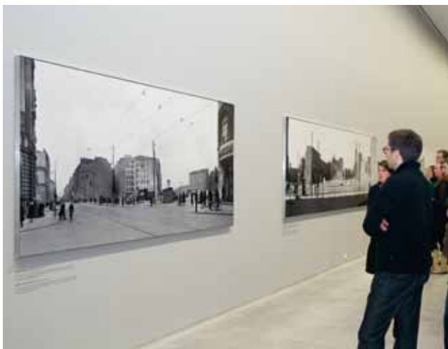
Perfect for mounting high-quality photographic art: gudy 802