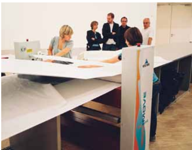
Panoramic photographs mounted with gudy 802 for the Berlinische Galerie

* The information presented in these application and processing instructions are based on our knowledge and findings obtained in practise. Due to the large number of factors which can influence the processing and application processes, individual customer tests are strongly recommended. A legally binding guarantee of specific properties is not to be inferred from this information. We reserve the right to make changes and corrections.