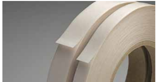
gudy 831 is also available in narrow widths!

Available widths: 61cm, 104cm, 122cm + 130cm