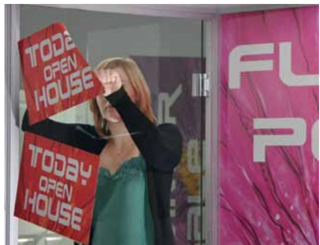
Applying advertising posters to shop windows is child's play with gudy window!

Available widths: 104cm, 130cm, 140cm + 155cm